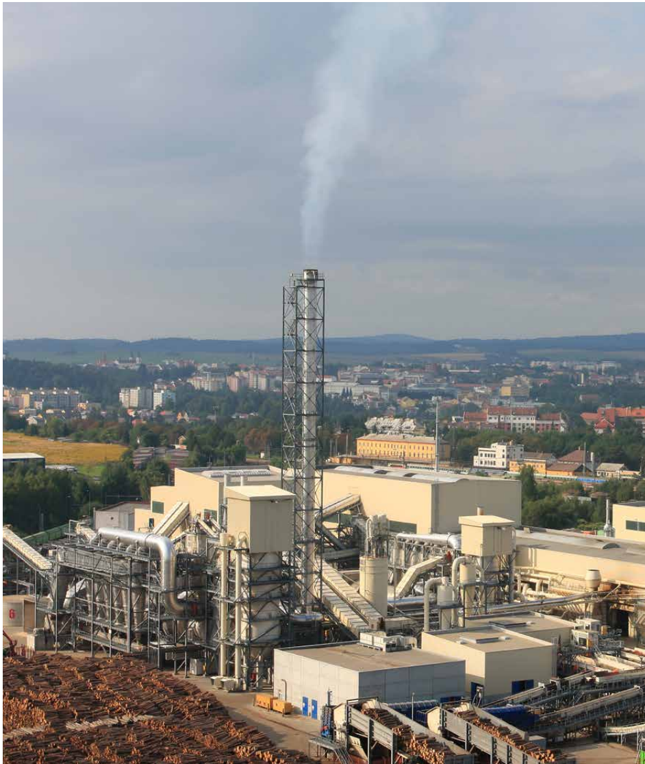
Kronospan Jihlava, a manufacturer of chipboards, was the largest polluter with cancer-causing chemicals according to data published in IRZ (Czech PRTR system) for several years, e.g., for the reporting year 2009 (Petrlik 2013).

The Arnika web application is available at www.znecistovatele.cz and contains identical data to the government database. At the annual level, it is possible to see the rank order of the largest polluters in the Czech Republic for particular groups of substances or specific substances. The great advantage of the map application is that it allows citizens to find out whether there is a polluting facility near their homes. For the reporting year 2009, the Kronospan Jihlava wood processing plant (manufacturer of chipboards) was the largest producer of cancer-causing substances due to high formaldehyde emissions (Petrlik, 2013).