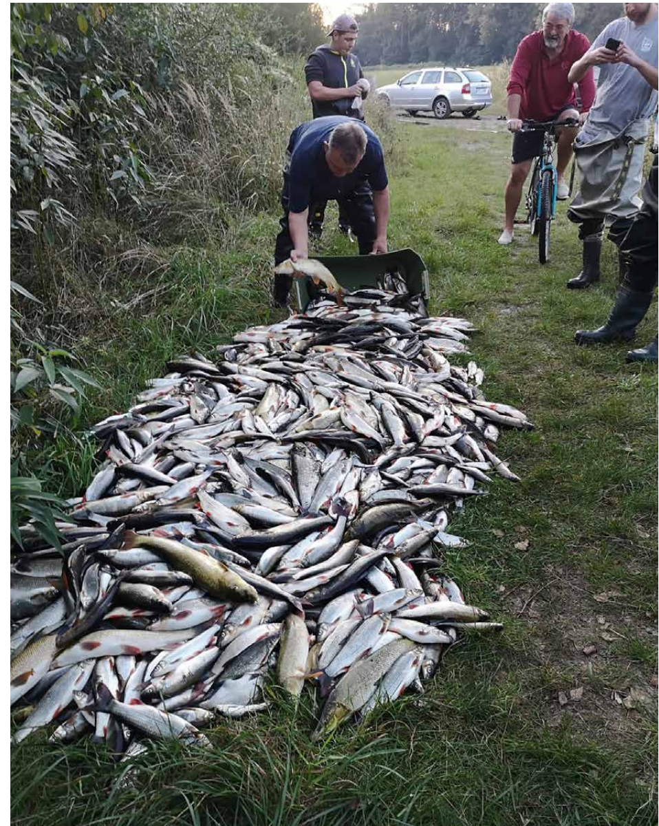
Cyanide poisoning on the Bečva River in September 2020.

PRTR does not regulate industrial activities but collects valuable information from them for fishermen. At the same time, PRTR, in combination with public data accessibility, puts pressure on industrial operations to better monitor and reduce their releases of toxic substances. In the case of accidents, PRTR helps to quickly identify the polluters.